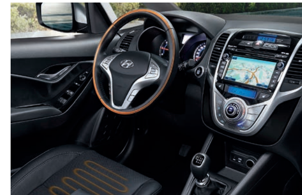
Heated steering wheel and seats. Nothing is more welcoming on a winter morning than heated seats and a heated steering wheel.