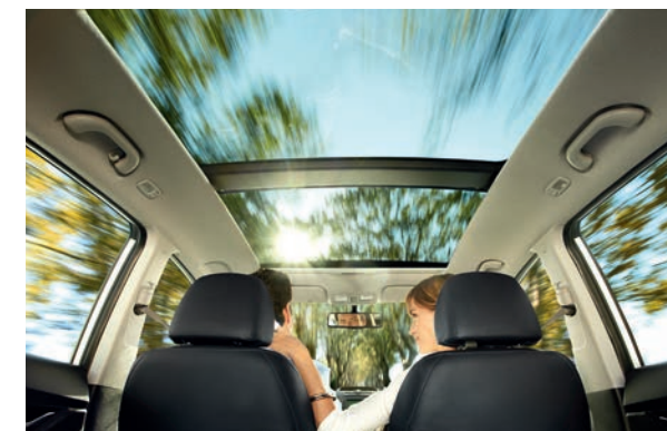
Panorama sunroof. The twin-panel roof creates a bright, airy ambience. At the touch of a button, the front panel tilts or slides open, adding the feel of open-air driving.