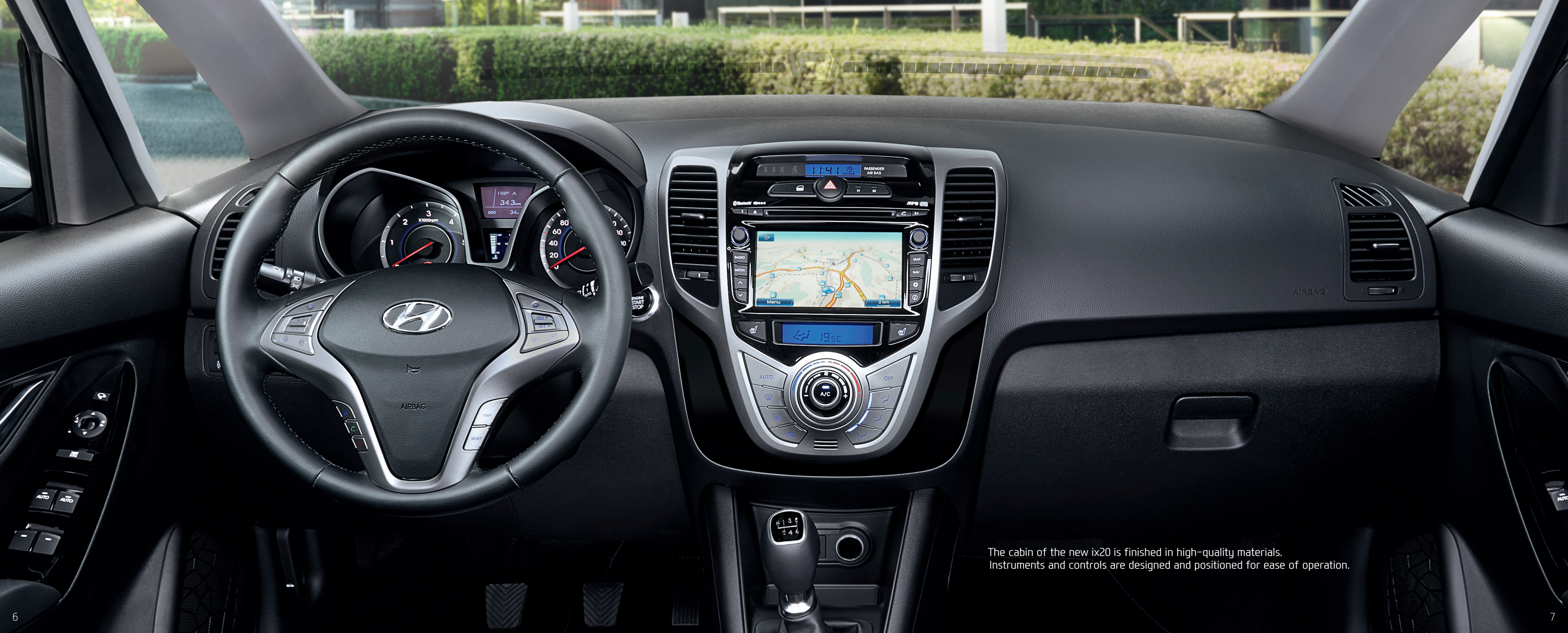
The cabin of the new ix20 is finished in high-quality materials. Instruments and controls are designed and positioned for ease of operation.