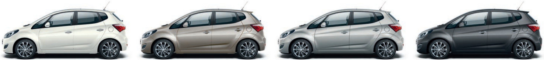
Polar White White Sand Platinum Silver Micron Grey

Your local Hyundai dealer will help and advise you with your selection.