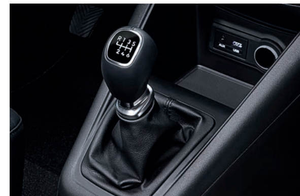
Six-speed transmissions. Diesel engines have 6-speed manual transmissions, as does the 1.6 petrol engine, which can also be specified with a new, high-efficiency 6-speed automatic transmission.