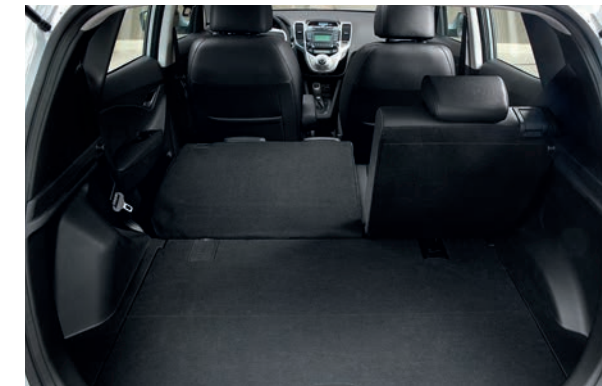
Variable carrying capacity. The large load space accommodates 440-litres of luggage beneath the retractable load-cover. A rear seat sliding function opens up even more space for those tricky larger items.