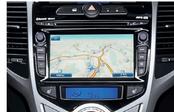
New generation audio and navigation system. The new audio system includes iPod connectivity, integrated My Music storage (1 GB) and AUX and USB ports. The navigation system has a 6.5" TFT colour touch screen that also functions as the display for the integrated rear view camera.

The new ix20 is available with the kind of features and technologies you may not expect in cars of this class. The wide-opening panorama roof extends the feeling of spaciousness, while the audio and navigation systems will keep you entertained and on track wherever your journey may take you.