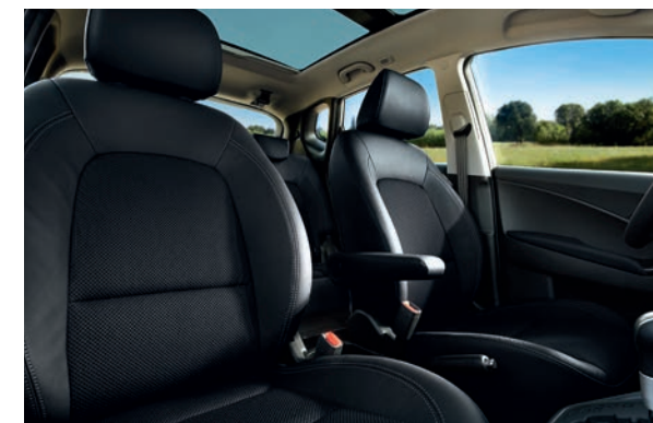
Interior space. With its 1600 mm high roofline and 2615 mm wheelbase, the ix20 offers more interior space than many larger cars, meaning families can travel in comfort even on the longest journeys.