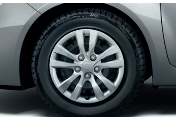
15" Steel Wheels