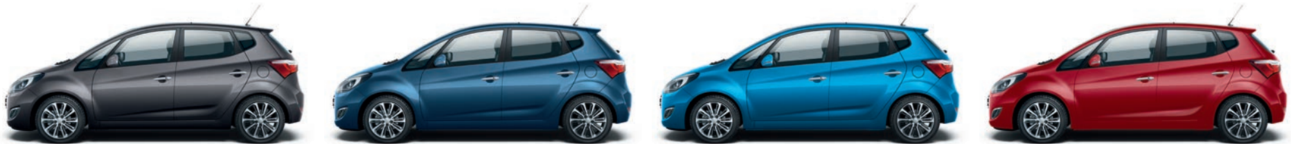
Thunder Grey Ash Blue Ara Blue Ultimate Red