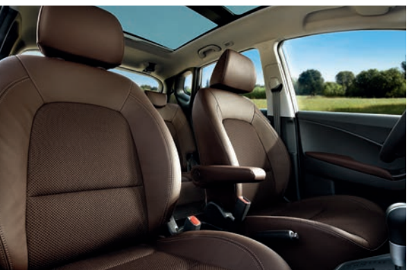
Brown Color Package