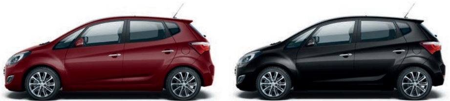
Ruby Wine Phantom Black