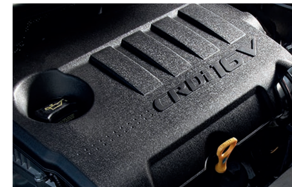
Engine upgrades. Both petrol engines have been revised to deliver improved fuel efficiency, and there's now more torque available from the two diesel engines. All are Euro6 compliant.