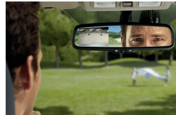
Rear parking assist. Reversing into confined spaces is simplified by parking sensors providing audible warnings of obstacles, and a rear camera that is monitored via the navigation screen or rear-view mirror.

You can configure the interior to carry passengers, cargo, or a mixture of both. A clever 60:40 fold & dive mechanism allows the rear seats to be folded flat into the vehicle floor, creating a class-leading total load space of 1486 litres. Powering the new ix20 is a range of upgraded petrol and diesel engines, available with 5-speed or 6-speed manual transmissions, or a new 6-speed automatic. Other practical features, like Rear Parking Assist and rear-view camera, make everyday driving easy and stress-free.